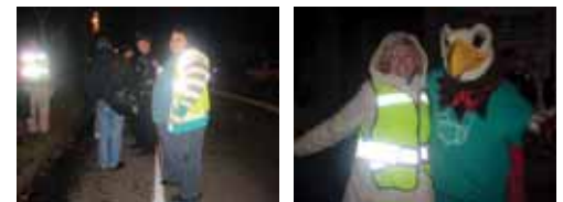
PAC TACers brace the cold

With 2010 upon us it gives us a chance to look back at 2009. I'd like to thank all of you that walked PAC TAC either on your own or with us for one of our HPNA group walks. My goal for 2010 is to gather a pool of HPNA PAC TACers that could saturate an area if we were seeing a crime pattern. Four or five nights of us walking might be enough to drive the criminals off to a less attentive neighborhood.