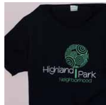
Highland Park Neighborhood T-SHIRT