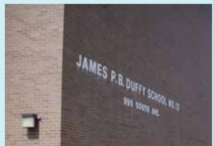
Meeting at James Duffy School #12